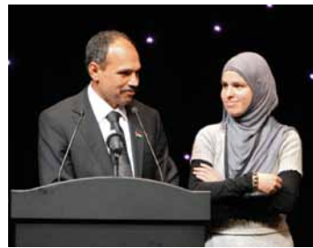
The protagonists deliver a moving speech about what they hope the film will achieve.