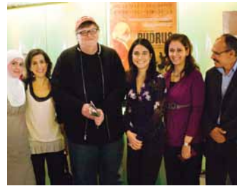
Michael Moore with the Budrus team at the Tribeca premiere.