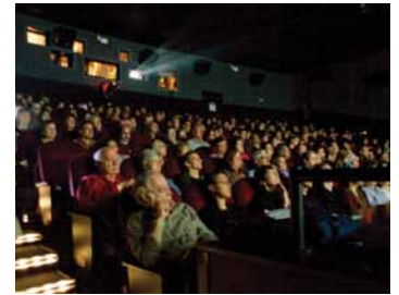
All four Budrus screenings at Tribeca were completely sold out.